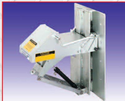
Available TRUCK-LOCK® Safety Systems