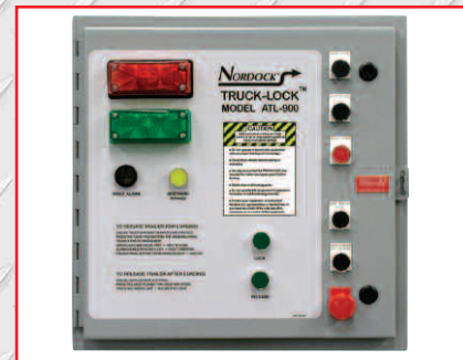
Optional Integrated Control Systems