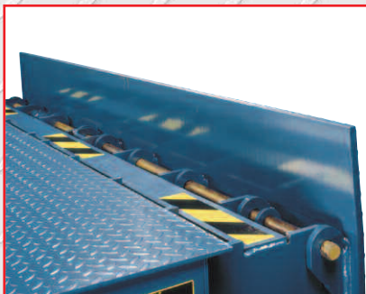
Available Safety Barrier Lip