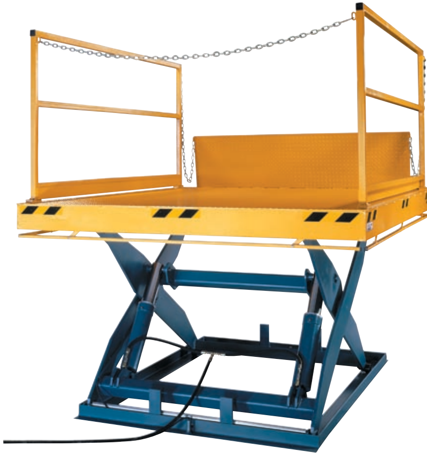
Shown With Optional Perimeter Electric Deck Stops