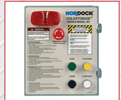
Optional LOGI-SMART™ Integrated Control Systems