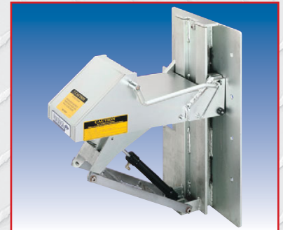
Available TRUCK-LOCK® Safety Systems