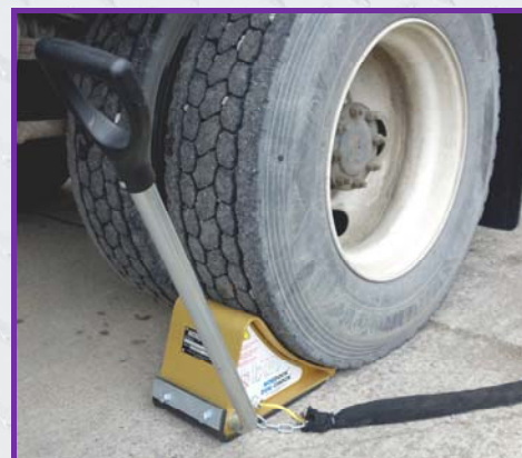
DOK-CHOCK™ IN POSITION